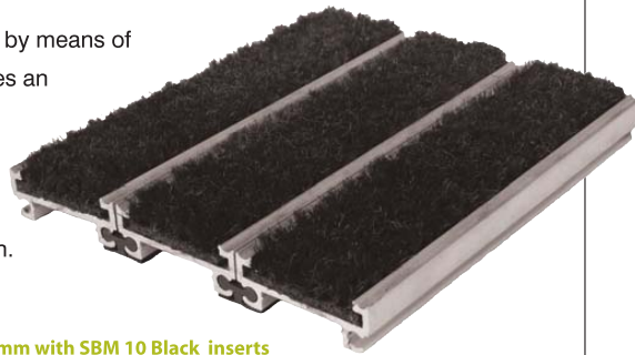
a-mats Hygiene-Plus 17mm with SBM 10 Black inserts

There is a wide variety of wiper strip options to suit almost any application.