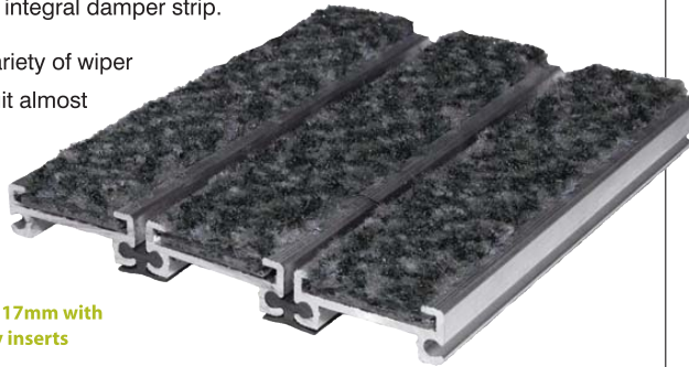
a-mats Dirt-Guard 17mm with SBM 24 Marble Grey inserts

There is a wide variety of wiper strip options to suit almost any application.